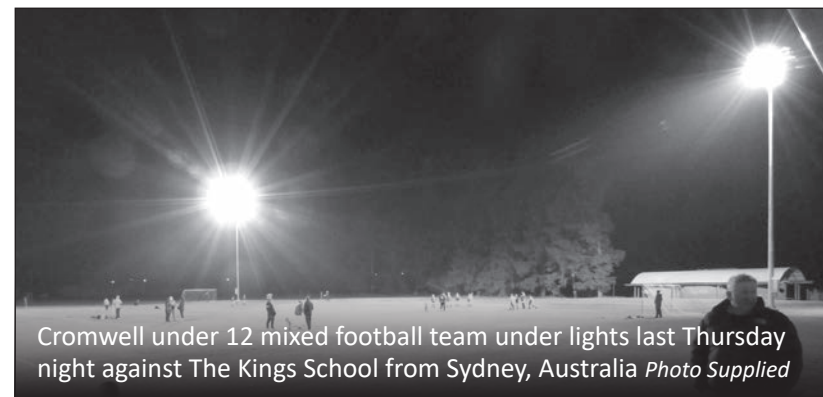
Cromwell under 12 mixed football team under lights last Thursday night against The Kings School from Sydney, Australia