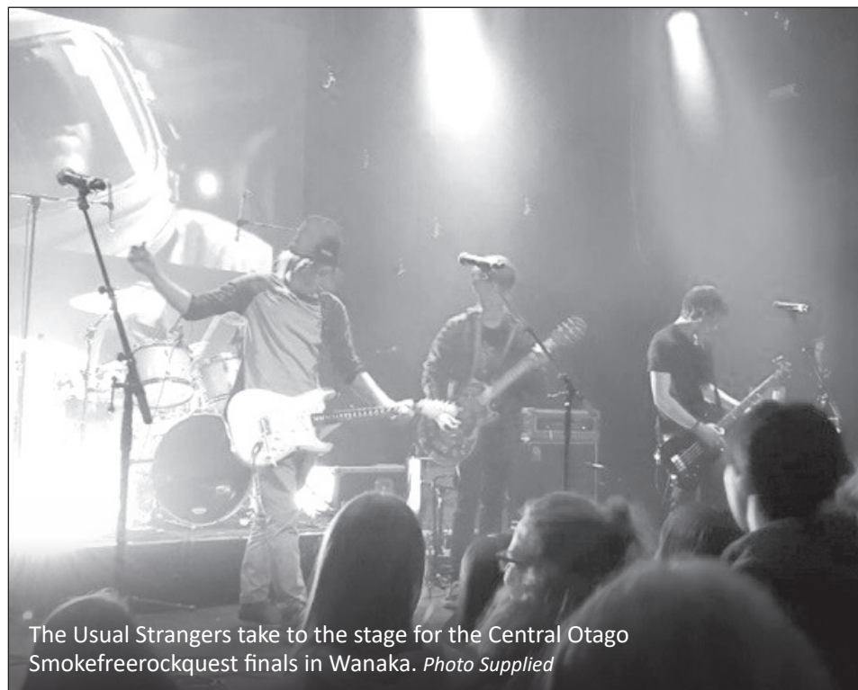
The Usual Strangers take to the stage for the Central Otago Smokefreerockquest finals in Wanaka.