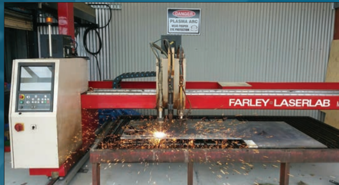
The CNC profile cutter in operation now at Highlands Engineering

Nigel Longman 027 227 5533 Workshop Address 17 Rogers St, Cromwell Email highlandsengineering@xtra.co.nz