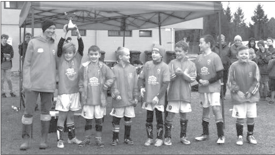
Cromwell ATD captured the Under 10 division two title on a sodden Sunday in Alexandra. Team and supporters were rightly overjoyed.