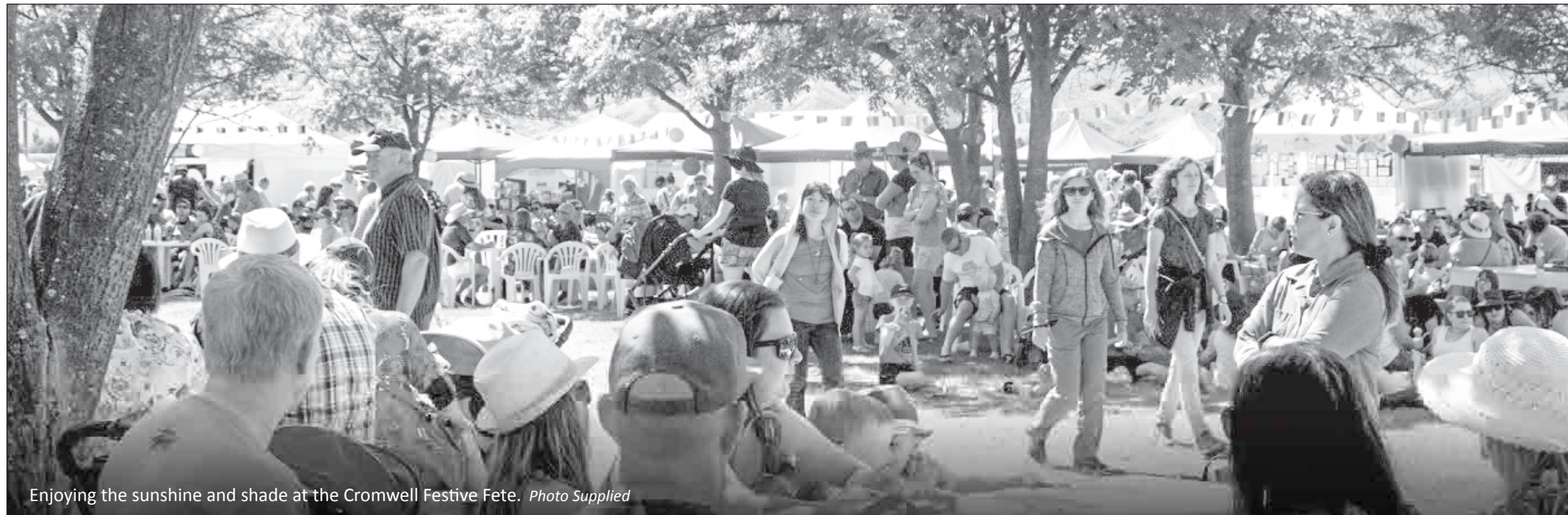
Enjoying the sunshine and shade at the Cromwell Festive Fete. Photo Supplied