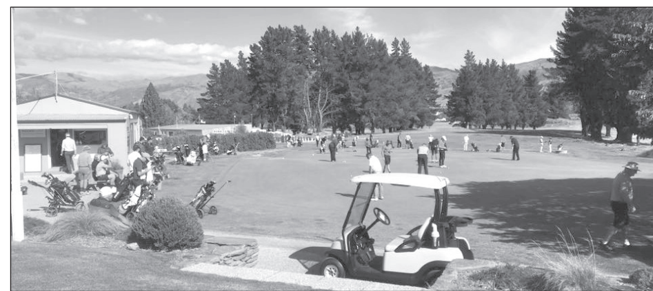
The SBS Cromwell Golf Club is enjoying a busy year, rising membership numbers, national tournaments and new ways of doing things are keeping everyone on their toes.

Along with both the upcoming men's and women's tournaments, the club is welcoming the opportunity to host NZ