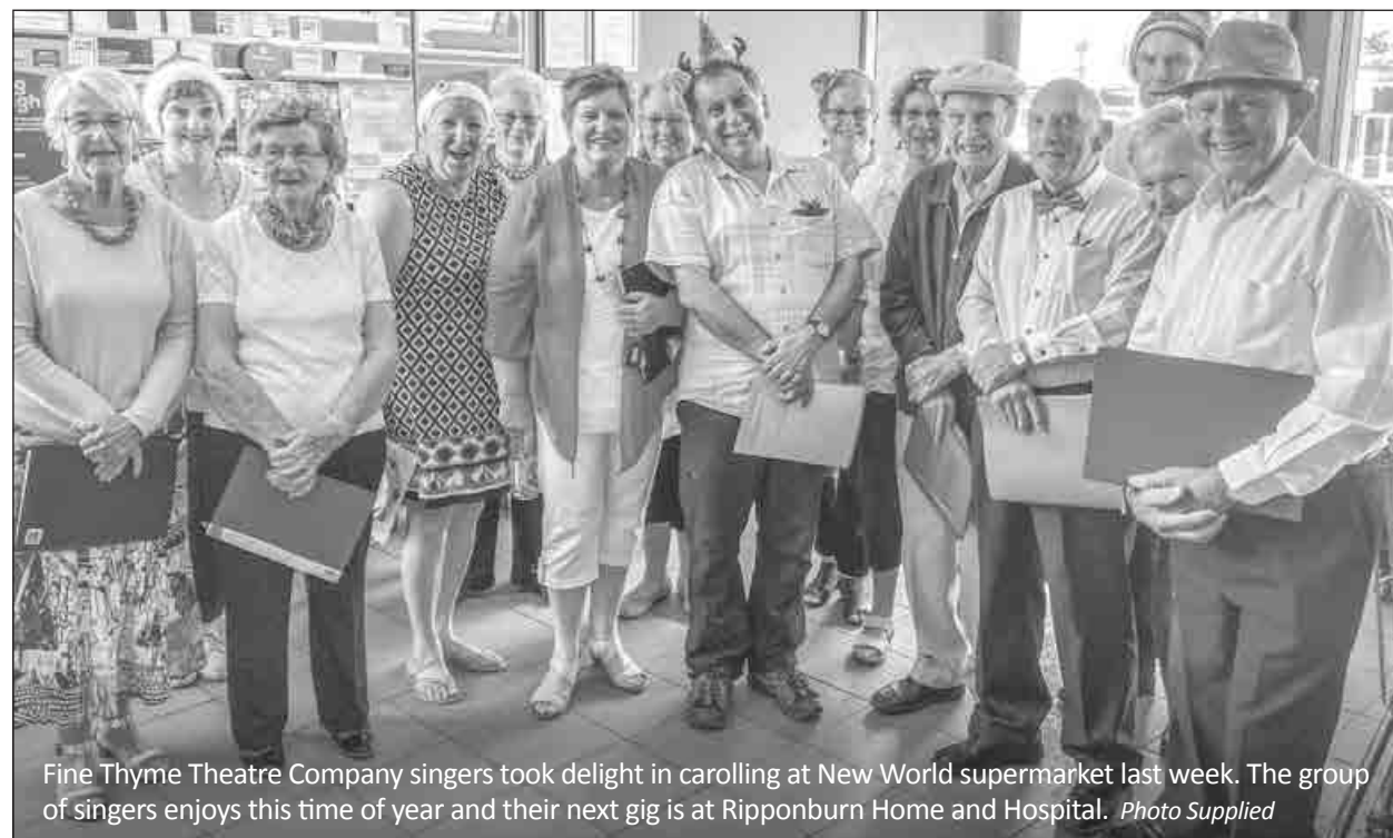
Fine Thyme Theatre Company singers took delight in carolling at New World supermarket last week. The group of singers enjoys this time of year and their next gig is at Ripponburn Home and Hospital.